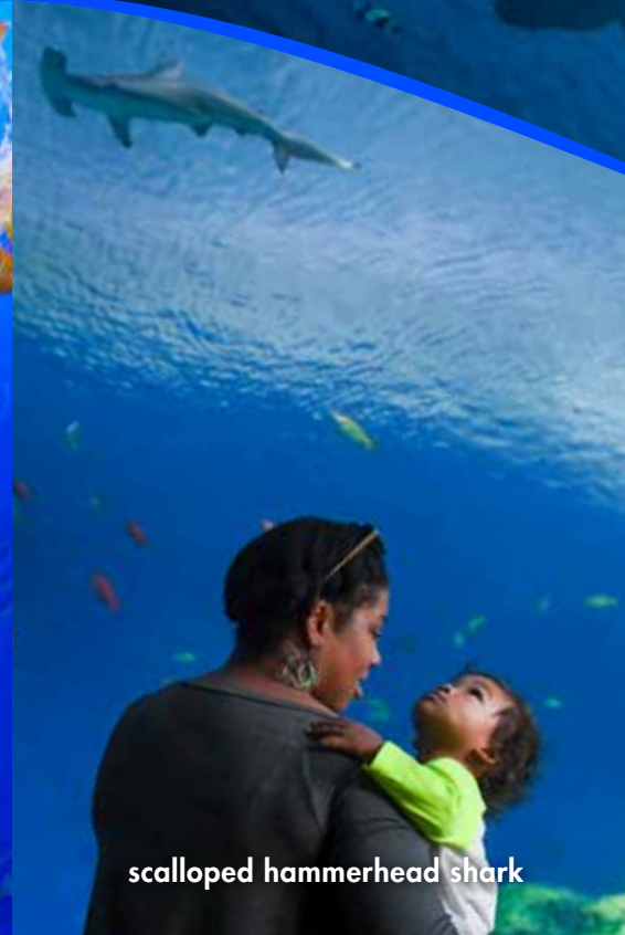
scalloped hammerhead shark