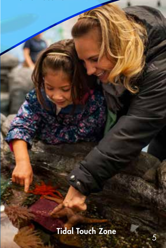
Tidal Touch Zone