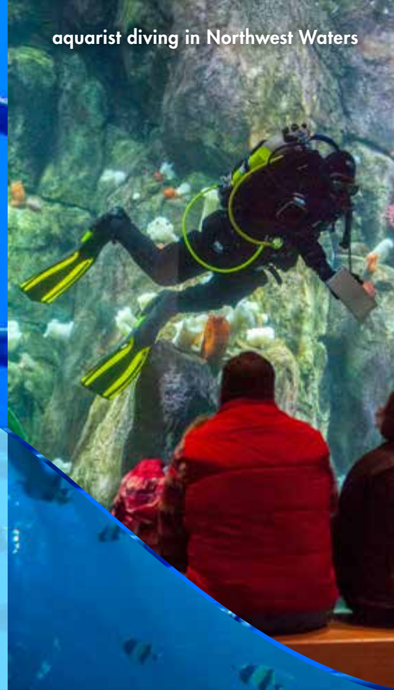
aquarist diving in Northwest Waters