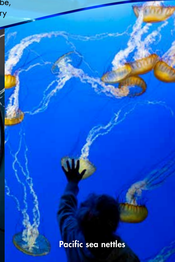
Pacific sea nettles