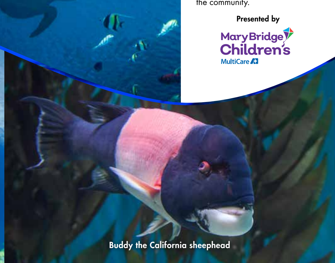
Buddy the California sheephead