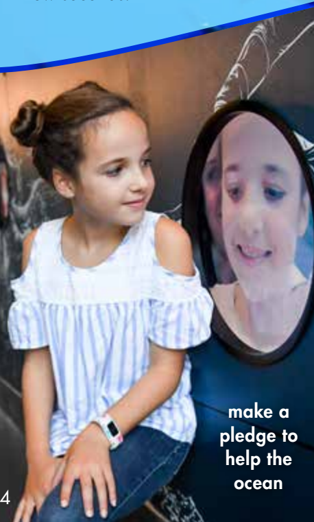
make a pledge to help the ocean