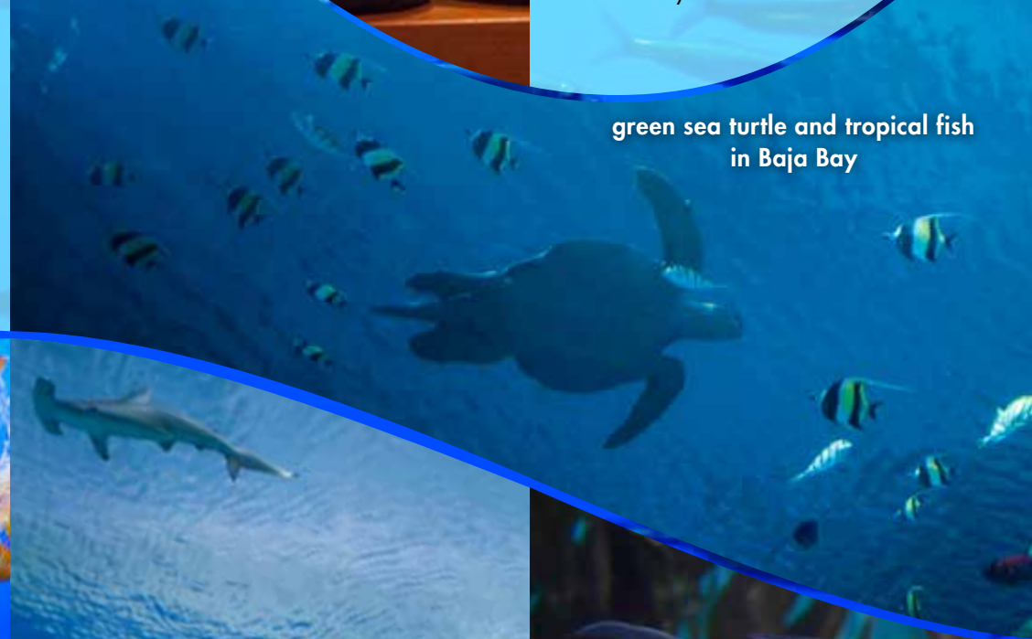
green sea turtle and tropical fish in Baja Bay