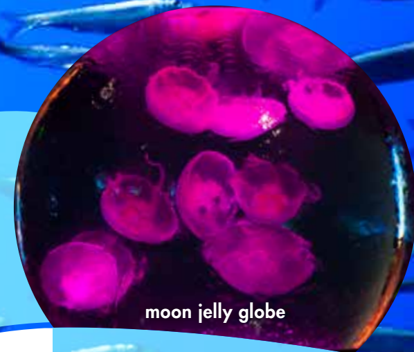
moon jelly globe