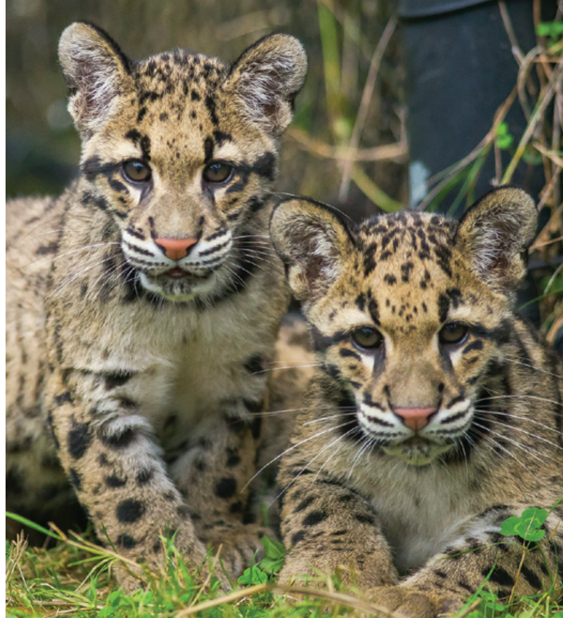
Banyan and Orchid