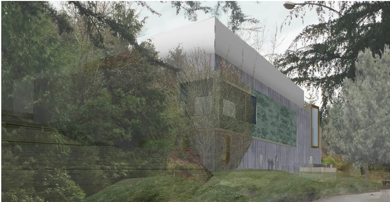
Architect's rendering shows a view of the aquarium from Five Mile Drive. Though exterior materials have not been selected, the sketch depicts how the aquarium will fit into its surroundings, keeping with the sense of place in Point Defiance Park.