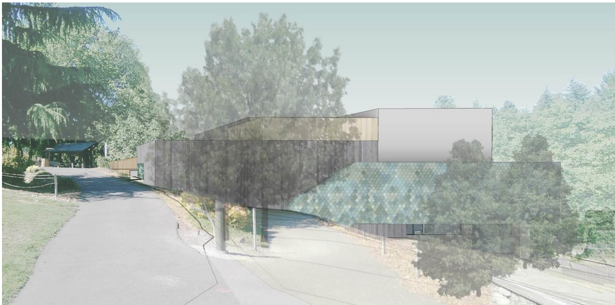
Architect's rendering shows the new aquarium from one of the pathways in the zoo. Though exterior materials have not been selected, the sketch depicts how the aquarium will fit into its surroundings.

Both meetings will include information on how the site was chosen and the aquarium's projected size and cost, as well as exciting details about the various galleries of marine animals that will be included in it.