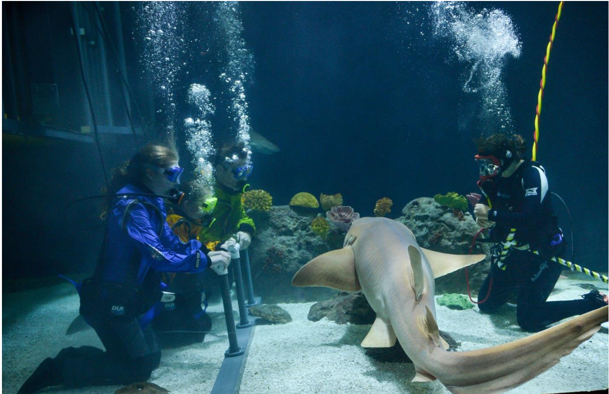
A nurse shark swims directly in front of participants in a test dive for the new Beyond the Cage program in the South Pacific Aquarium at Point Defiance Zoo & Aquarium. A trained diver-guide kneels in the sand to the right of the shark.

The new program is the only one of its kind in the nation.